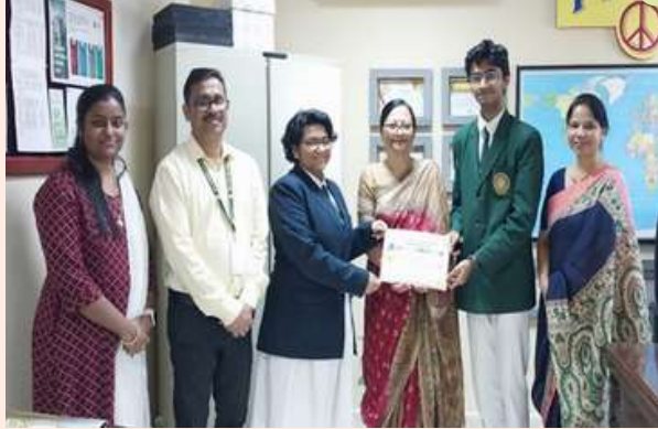
Grade XI B