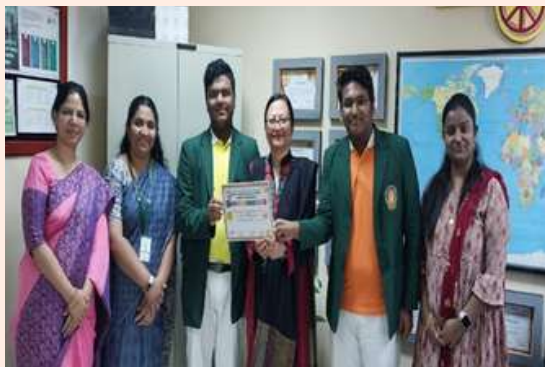
Grade XI F