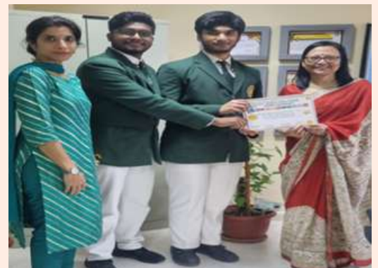
Grade XII I