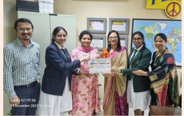
Grade XII J