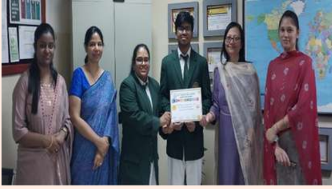
Grade XI C