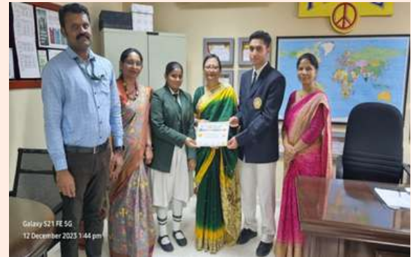
Grade XII D