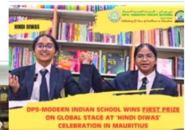
DPS-MODERN INDIAN SCHOOL WINS FIRST PRIZE ON GLOBAL STAGE AT 'HINDI DIWAS' CELEBRATION IN MAURITIUS